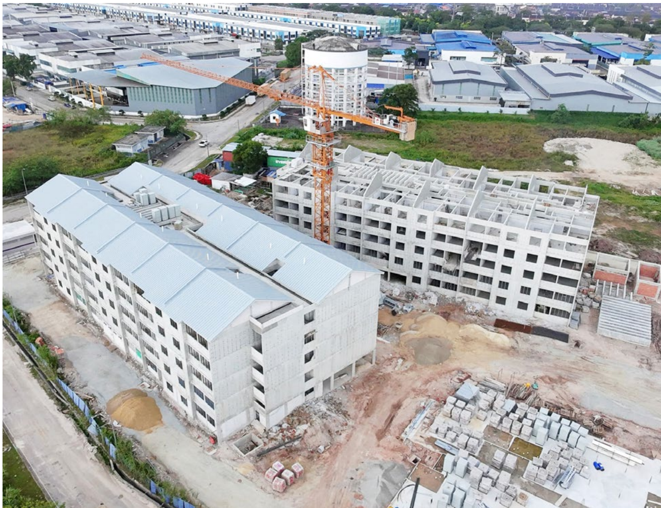
Site progress as of February 2025.