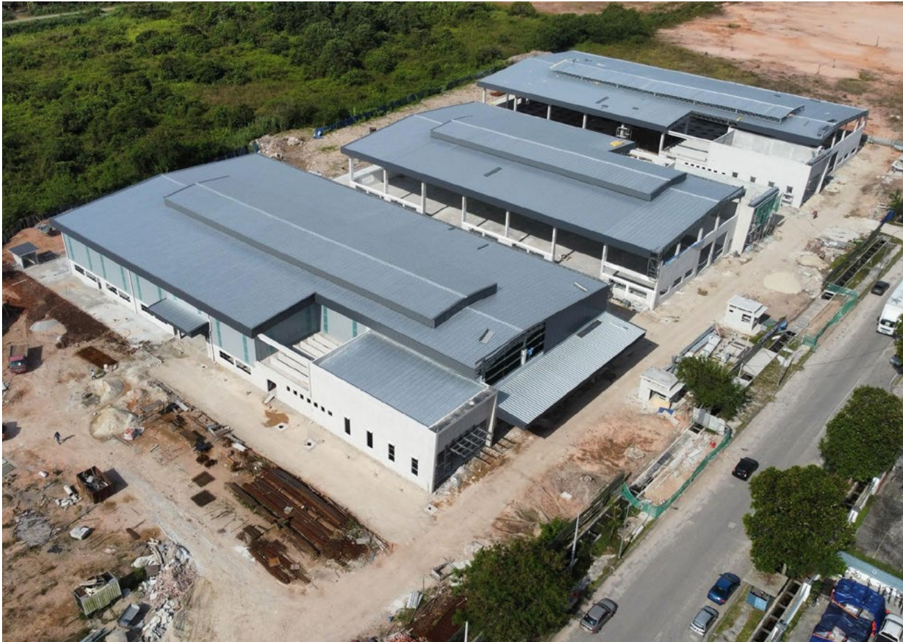
Site progress as of February 2025.

4 units of single-storey detached factories at Pekan Nenas Industrial Park, Pekan Nenas, Johor.