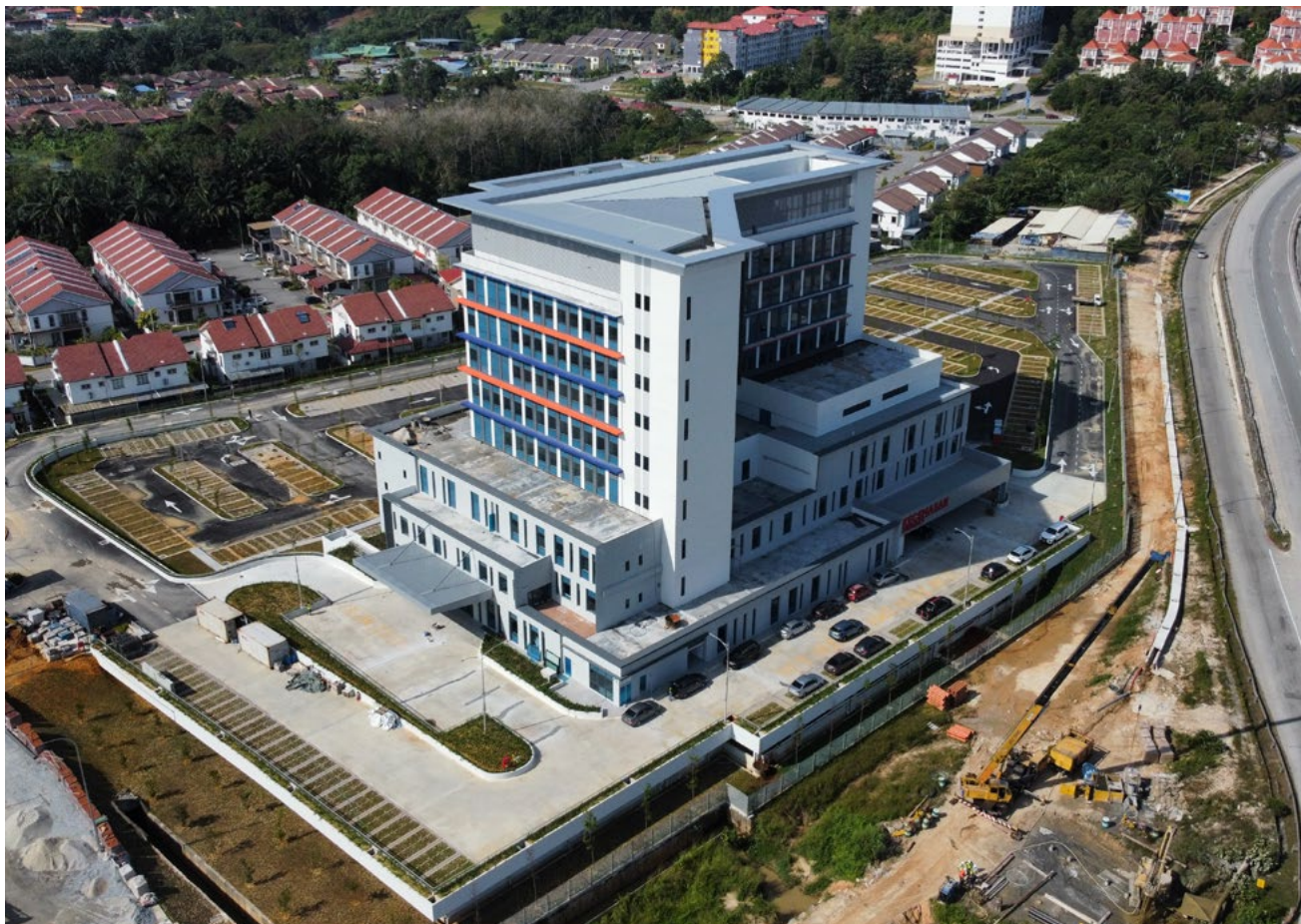
Site progress as of February 2025.