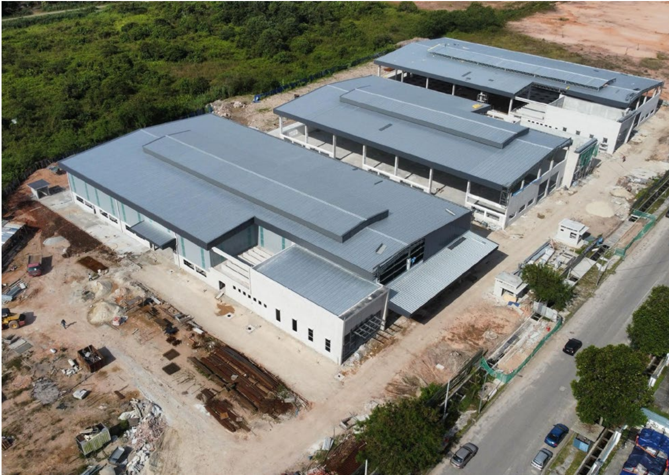
Site progress as of February 2025.