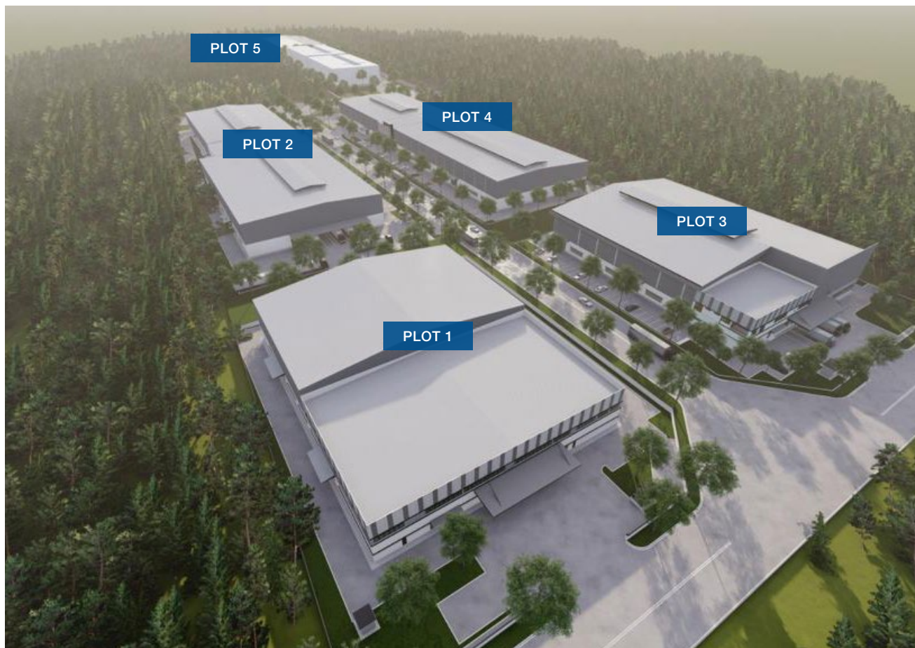
Site progress as of February 2025.