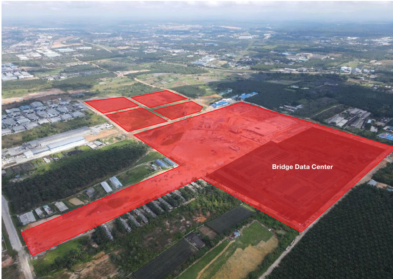
Site progress as of February 2025.