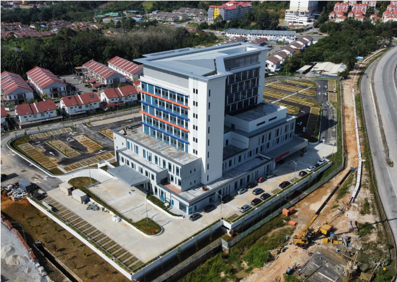
Site progress as of February 2025.

121 beds of private hospital at Sepang, Selangor.