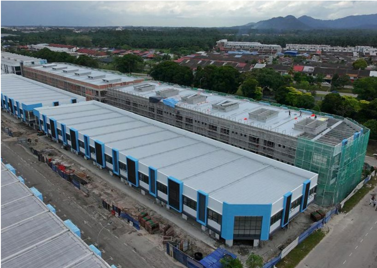
Site progress as of February 2025.

48 units of two storey and three storey shop offices at Pekan Nenas Industrial Park, Johor.