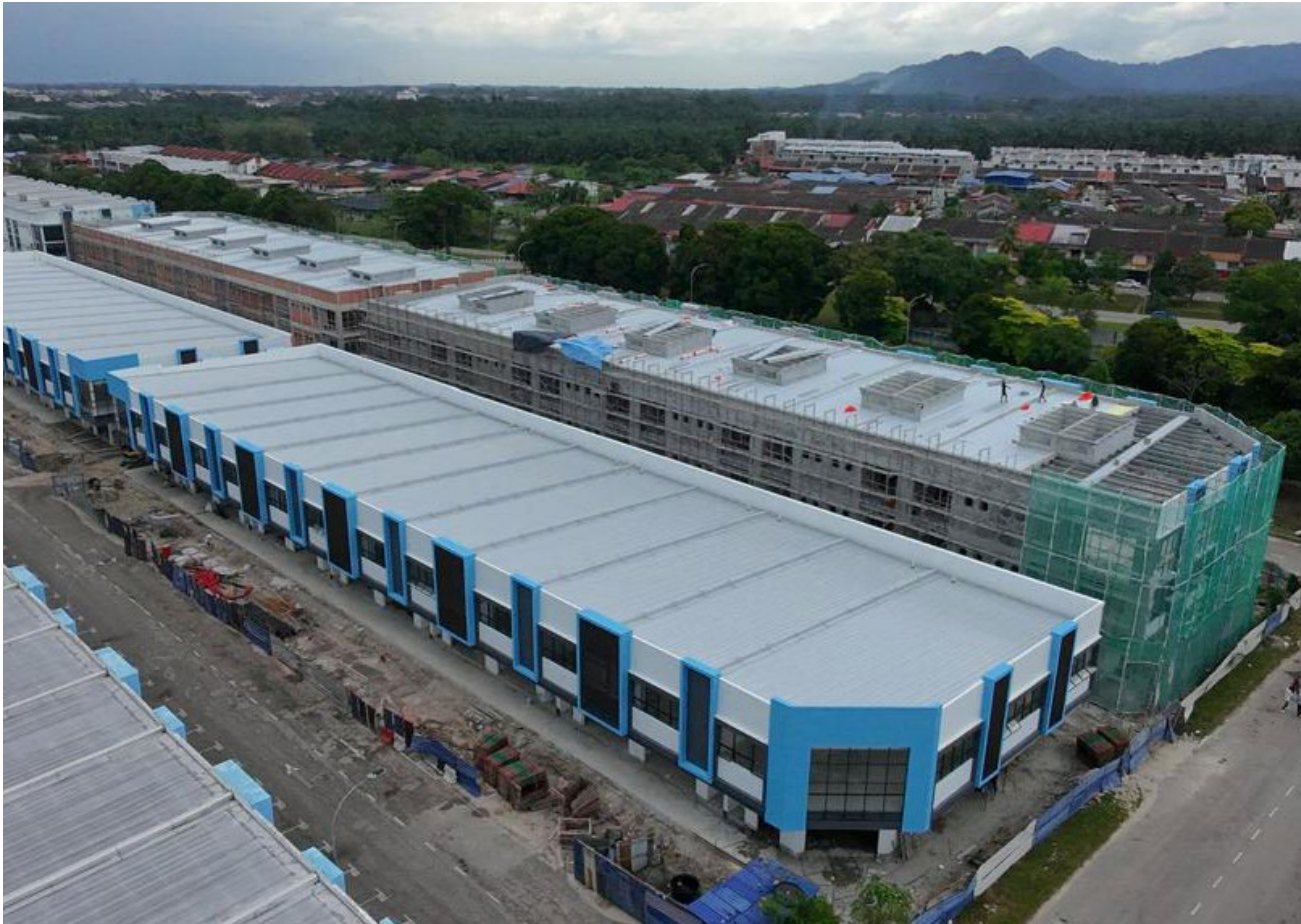
Site progress as of February 2025.