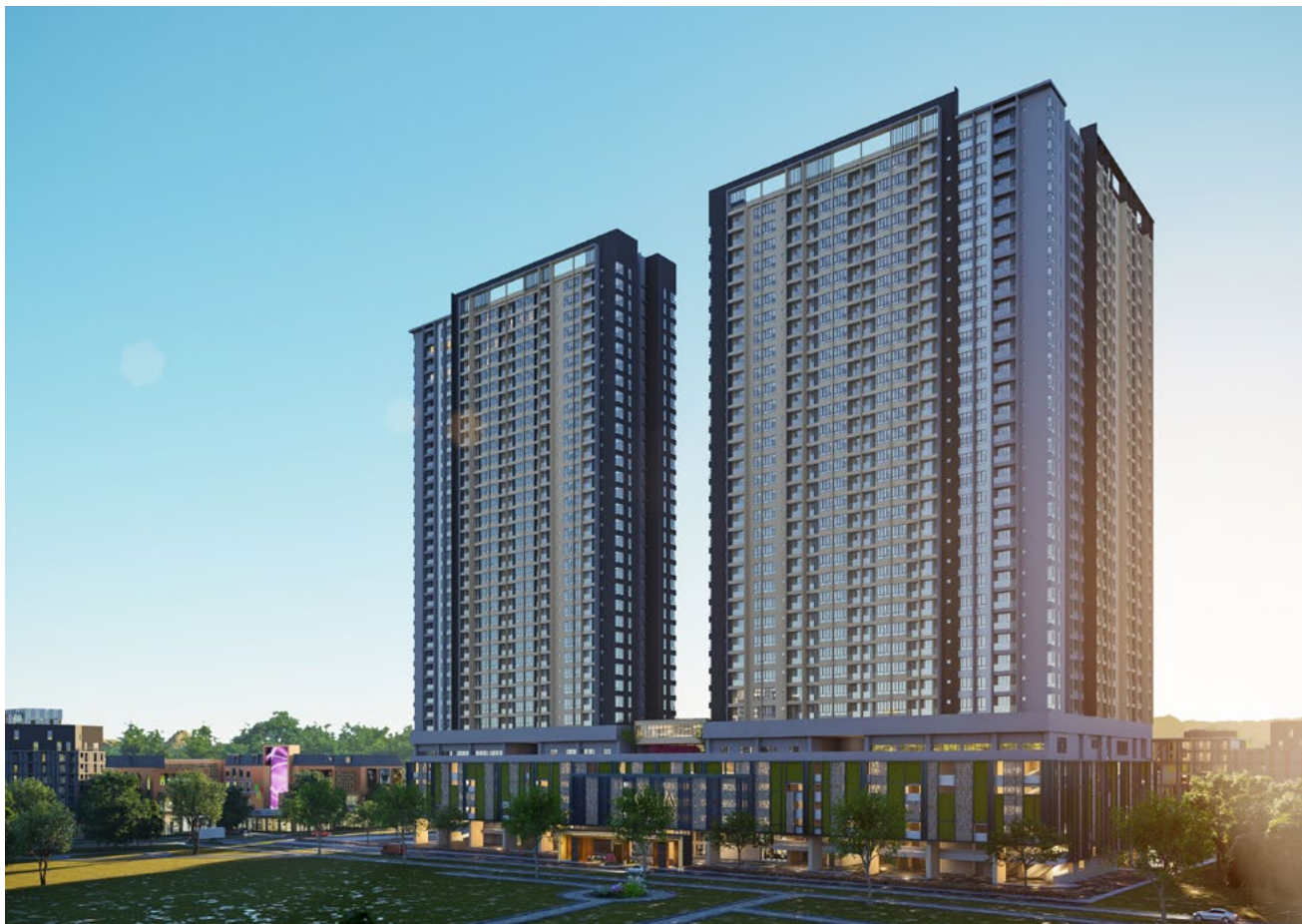
Artist's impression only.